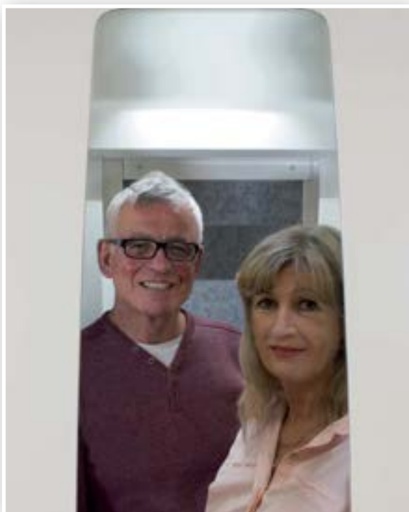
Full height glazed door