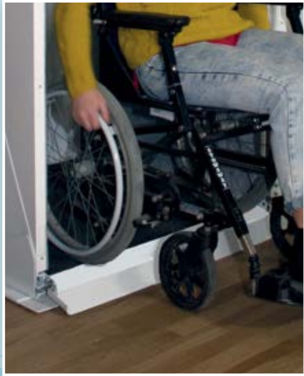
Automatic folding ramp for easy access for wheelchair users (S & LW models)