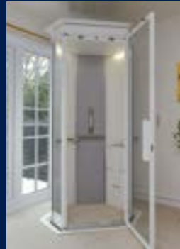
Lifestyle Home Lift

For further information or to book your free home survey, call us today on 0345 365 5366 or visit www.terrylifts.co.uk to view our full range of home lifts