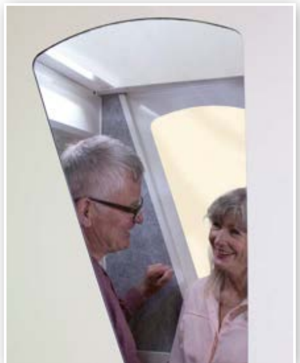
Glazed side panels