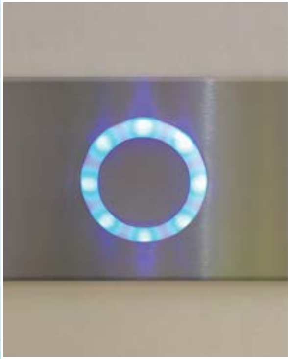
One-touch LED controls in the lift car and wireless call stations on both landings