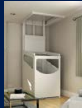
Harmony Home Lift